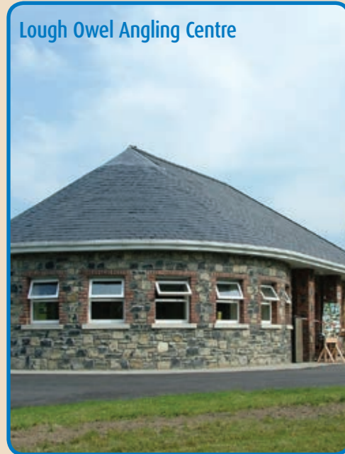
Lough Owel Angling Centre