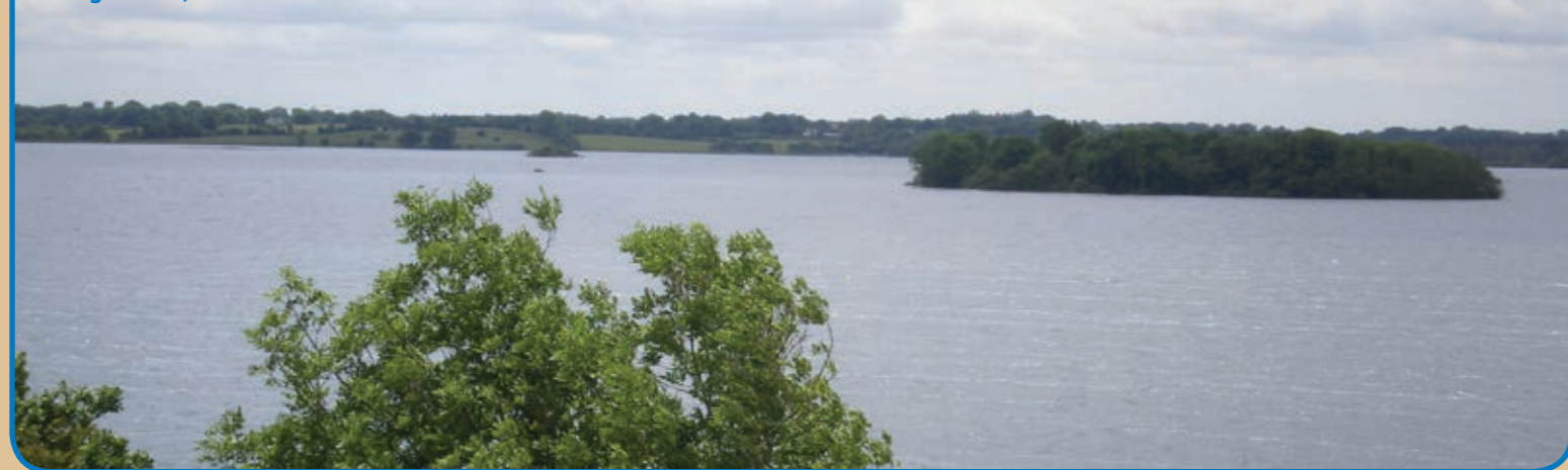
Lough Owel, Co. Westmeath

This drift will produce results right through the angling season regardless of the wind direction. Anglers can drift with a southerly wind off Mulally's shore in a line out past Lady's Island. A westerly wind starting at the back of Srudarra island will take the angler along the Tullaghan shoreline out past Lady's and on towards Mulally's slipway.